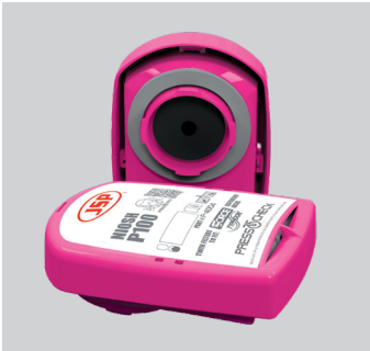
P100 PRESSTOCHECK™ FILTERS 42 CFR Part 84 Subpart K

Safety Managers have a duty to ensure that the staff for which they are responsible are as well protected as they can be. This means they must not only put in place the appropriate engineering controls to stop/reduce airborne respiratory hazards but also provide adequate and suitable Respiratory Protection. Ensuring that a particular Respiratory Protection is suitable for the user can be complex. Safety Managers are therefore looking for a simplified approach that gives reassurance that their staff are protected. Having reviewed JSP's Force Typhoon™ and PressToCheck™ filter system, several Safety Managers have told JSP that this combination of Respiratory Protection can provide better protection for their staff.