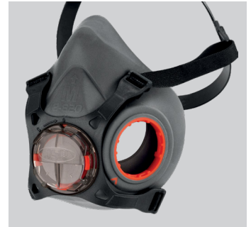
FORCE TYPHOON™8 LARGE 42 CFR Part 84 Subpart K