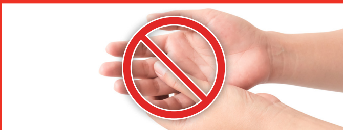
POTENTIAL REPETITIVE STRAIN INJURIES (RSI)