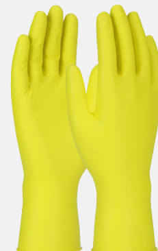
PIP® Grippaz® Jan San sized S - 2XL