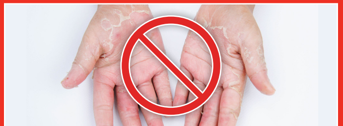
RISK OF SKIN INFECTIONS FROM REPEATED USE